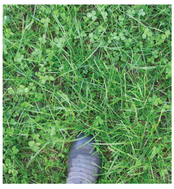
TREATED PROGIBB SG APPLIED 2 DAYS AFTER GRAZING, PHOTOS TAKEN 21 DAYS AFTER APPLICATION.