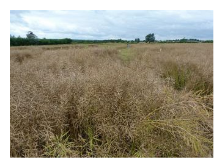
AST glyphosate + adjuvant