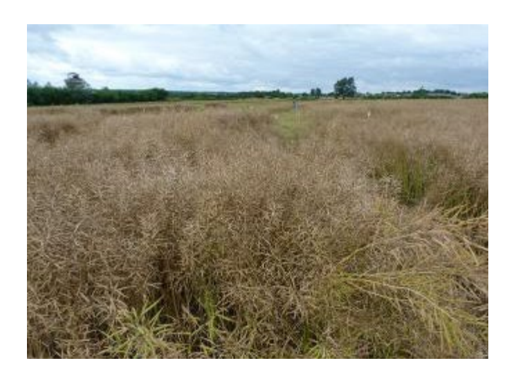
AST glyphosate + adjuvant