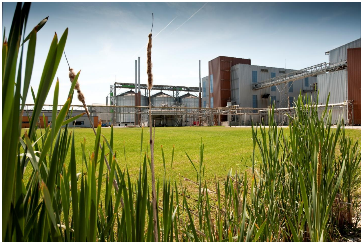
Saipol processing facility at Rouen in France ready to process the first shipment of Nuseed Carinata into renewable fuel with best in class greenhouse gas (GHG) reduction.